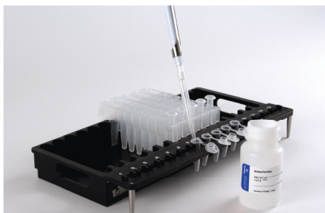
Figure 2. Setup and configuration in the deck tray(s). Nuclease-Free Water is added to the Elution Tubes as indicated.